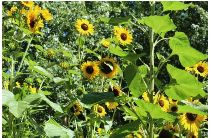
September Sunflowers