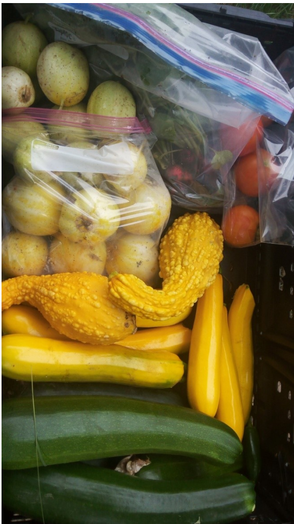
1,304 pounds of produce was given to the Food Bank