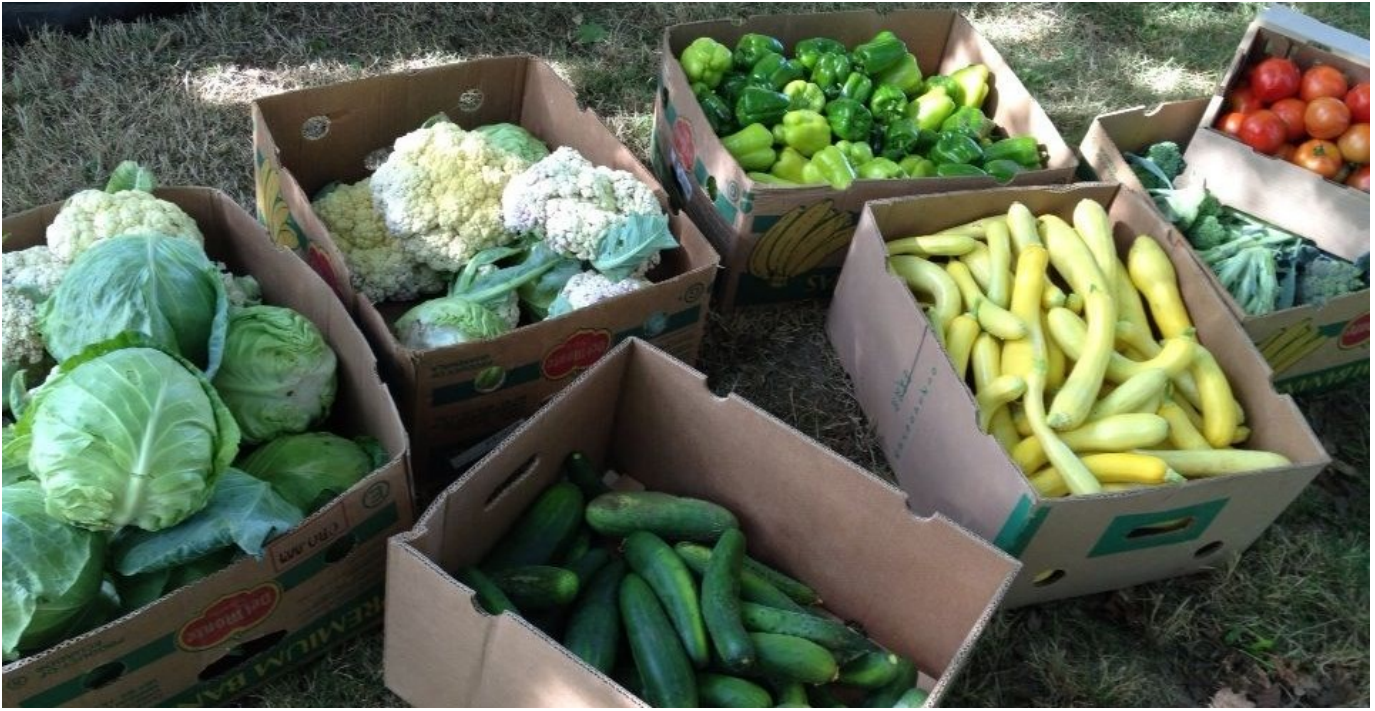
Part of our harvest on July 21st